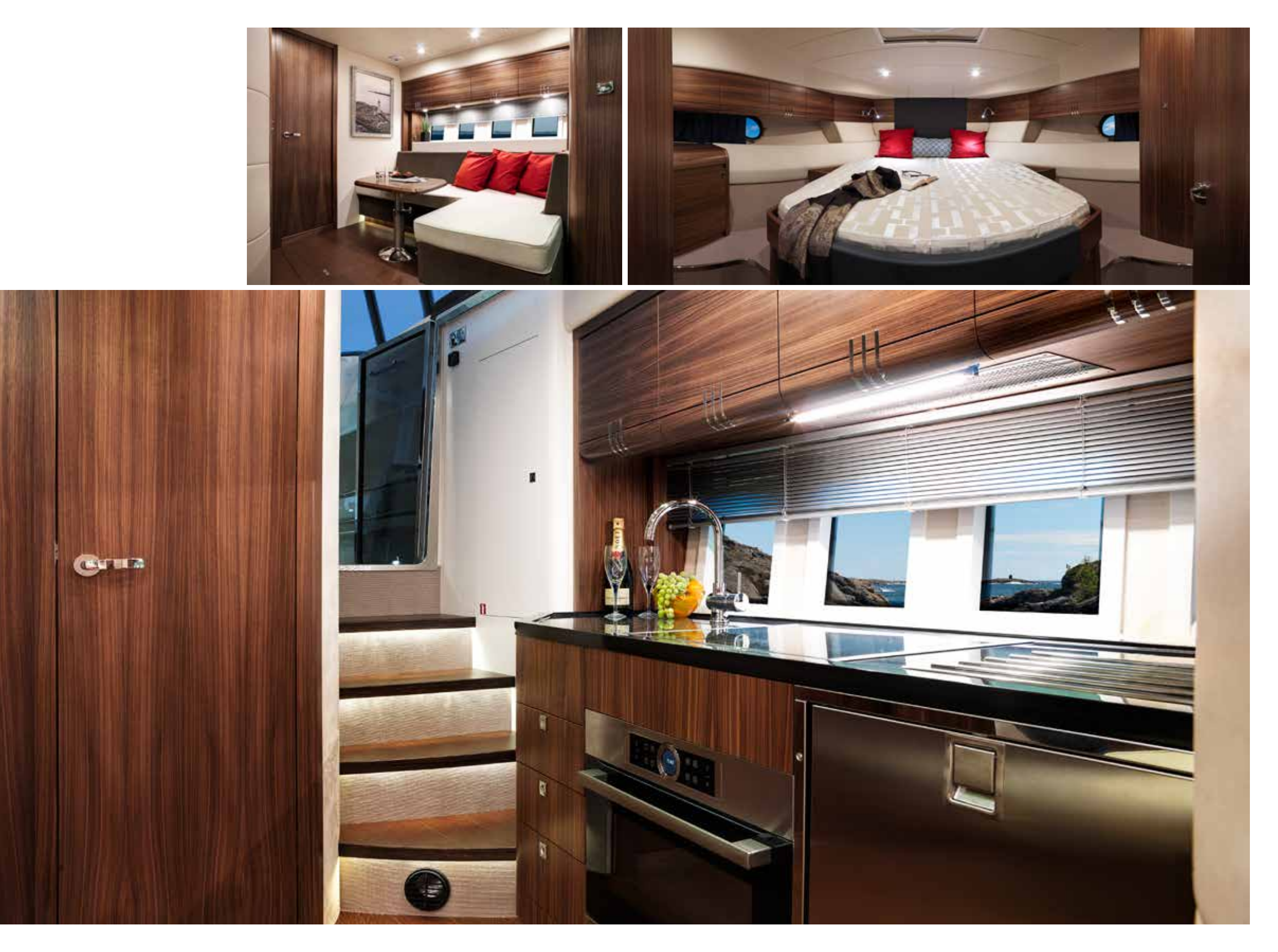
Down below, this family-friendly cruiser is unusual in offering three spacious cabins and two shower compartments. The superyacht standard interiors are by renowned designer, Peder Eidsgaard, and feature plenty of natural light and panoramic windows in the saloon.