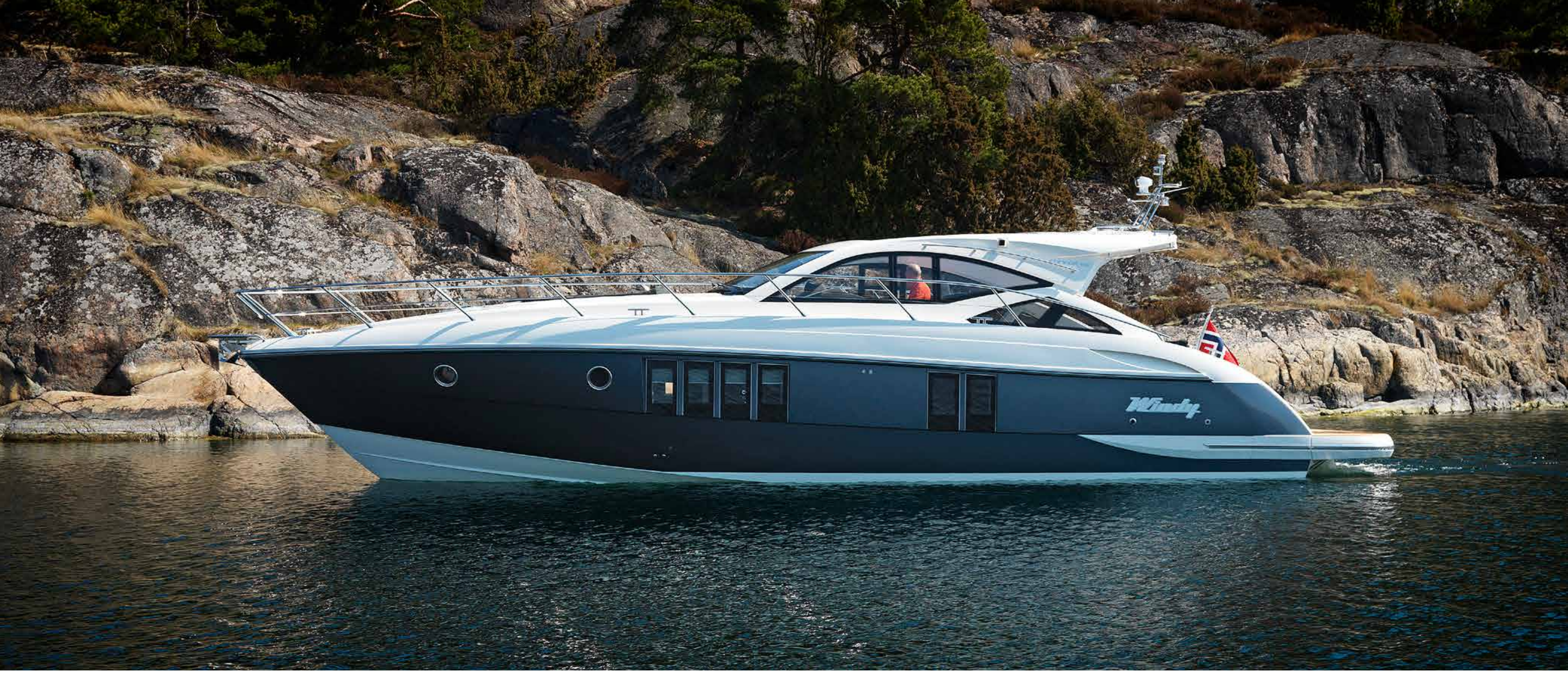
With a sleek hardtop and extended sun roof as standard, the 46 is well suited to hot or cooler climates. Her large sociable cockpit has plenty of space to relax or entertain, and feels safe and secure under way, even in more challenging conditions.